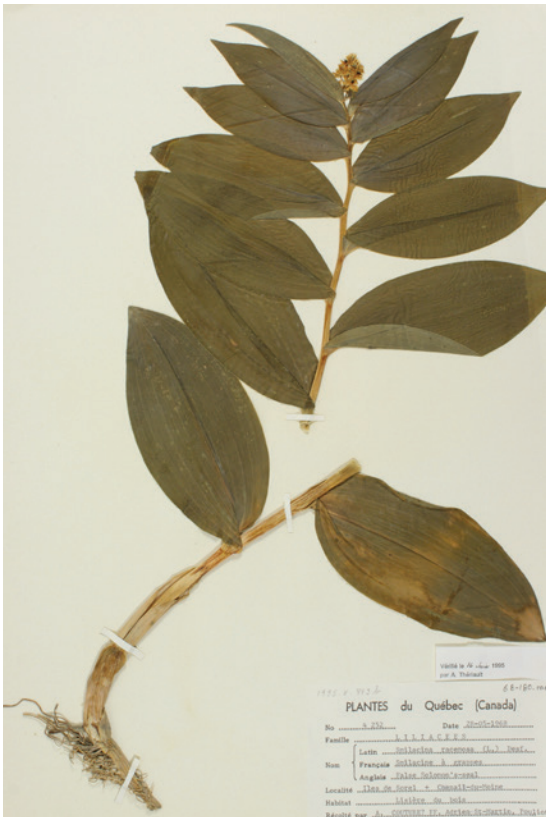
False Solomon's seal, (1995.X.883B) collected in 1968 at Chenail-du-Moine by Allyre Couture and Brothers Adrien Saint-Martin, Pouliot and Chabot.

Today the botanical collection of the Museum has 4,053 specimens registered and entered in databases. It is for the most part made up of voucher specimens of plants and includes algae, mosses, lichens and mushrooms that have not yet been entered in the database. These probably have not yet delivered up all their secrets.