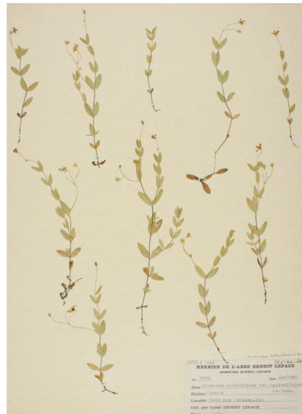
Sabline latérflore d'Ernest Lepage (1995.X.1060)